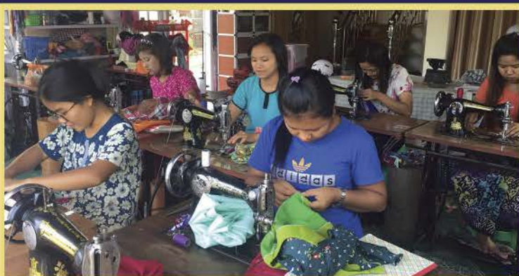
POY A MEH SEWING SCHOOL

There is so much work going on in all areas of ministry. Jehovah Jireh Farms was sown in sunflowers this past spring, as a result of crop rotation. These sunflowers are harvested exclusively for cooking oil. They are truly a beautiful sight to watch – seven acres of sunflowers in bloom. After the sunflower harvest, we dug a much-needed irrigation ditch that permitted us to get more water on the field and allowed us to plant our rice on-time with the rains. Again, we had favor and were able to plant when many of our neighbors could not. We are expecting a greater harvest again this season.