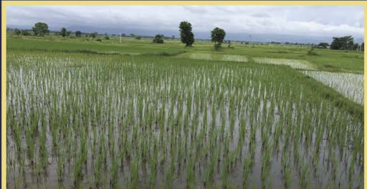
JEHOVAH JIREH FARMS