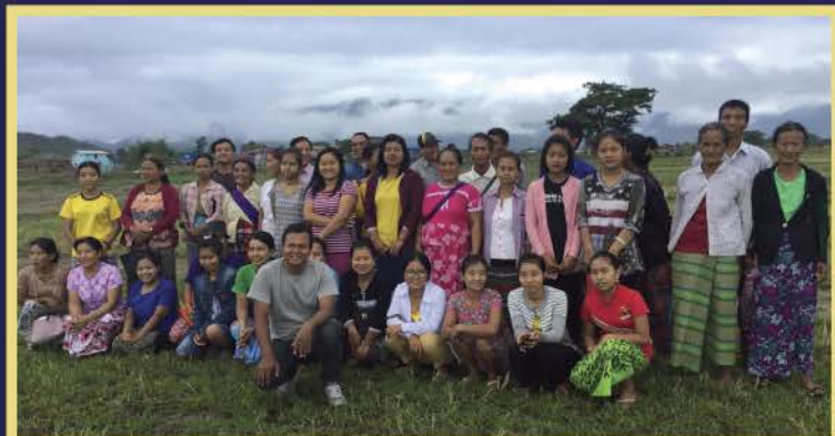
SCHOOL OF THE HARVESTERS

In nine weeks, we will graduate another class of young women from the Poy A Meh Sewing School. We look forward to teaching there and seeing all they have learned. Their excitement is a fun experience to share. It is always humbling to hear their gratitude for being provided an opportunity they could not get anywhere else. Currently we are using a rented space that has no electricity. We still maintain a 3-year waiting list simply because we have no room. These at-risk girls are eager to learn in fact, one 15-year-old girl traveled 200 miles by herself just to ask us if we would train her. Thanks to your generosity, these girls will never be lured into trafficking.