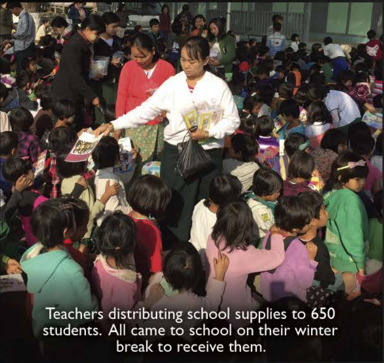
Teachers distributing school supplies to 650 students. All came to school on their winter break to receive them.