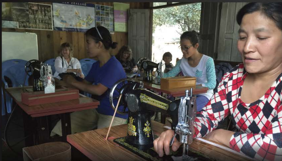
This young lady was so excited for an opportunity to change her life!