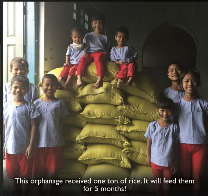
This orphanage received one ton of rice. It will feed them for 5 months!