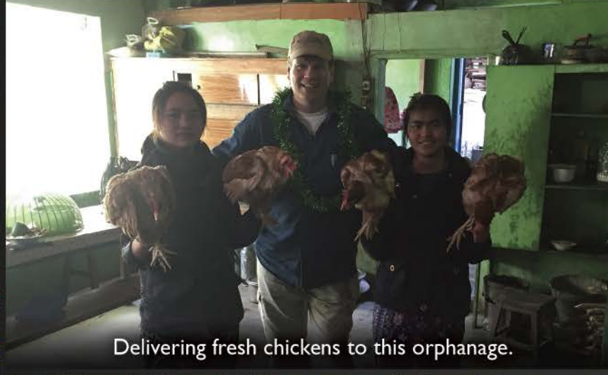
Delivering fresh chickens to this orphanage.