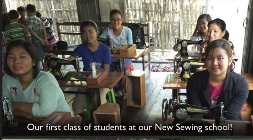
Our first class of students at our New Sewing school!!