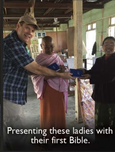
Presenting these ladies with their first Bible.