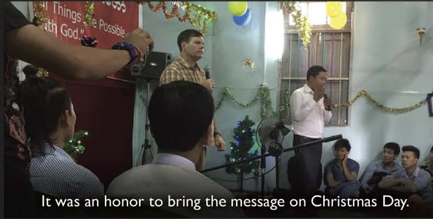
It was an honor to bring the message on Christmas Day.