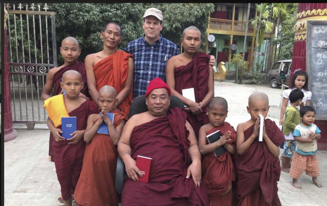
First time for a foreigner to visit, first time to hear the Gospel, first Bibles and a standing invitation to come back. God is so good!