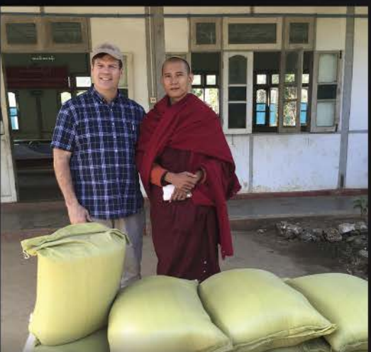
Another first, we met this Buddhist monk and he allowed us to present the Gospel to his orphanage of 75 boys. We also delivered them a half ton of rice.