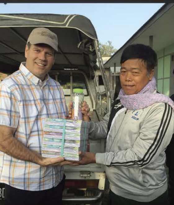
Presenting this Principal with notebooks and pencils for his school. We were the first foreigners to visit them..